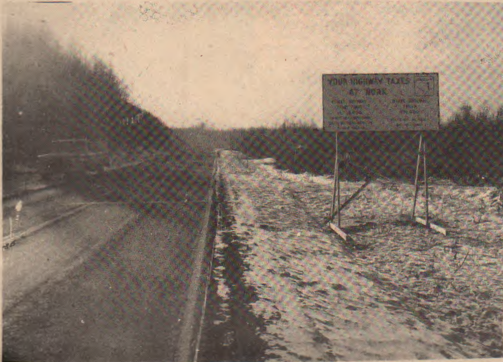
"YOUR HIGHWAY TAXES ARE AT WORK". THESE NEWLY ERECTED SIGNS INFORM THE PUBLIC. THEY SIGNAL THE START OF CONSTRUCTION OF THE NEW EAGLE RIVER TO PETERS CREEK HIGHWAY.