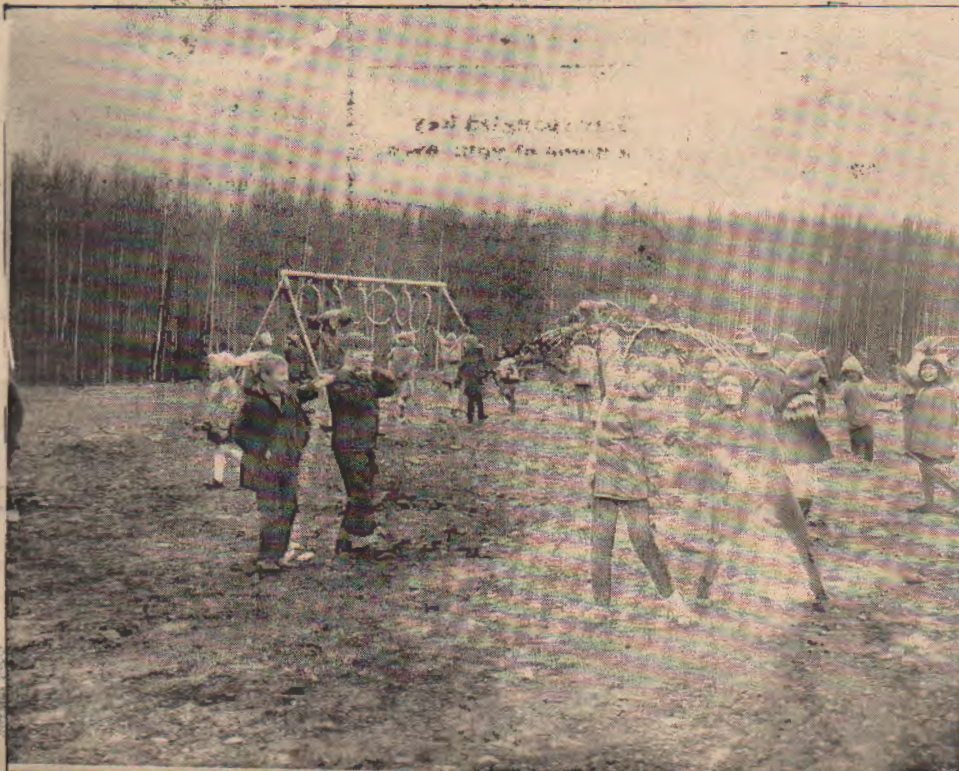
HAPPY BIRCHWOOD SCHOOL CHILDREN HURRY OUT AT RECESS TO ENJOY THE JAMISON RINGS AND THE BUNKER HILL CLIMBER PURCHASED FOR THEM BY THE BIRCHWOOD PTA.

ANCHORAGE: The hotly contested Garbage Burning Ordinance will be up for Public Hearing on Monday, October 14th at 8:00pm. The Hearing will take place at the Borough School Administration Building on Fireweed Lane in Anchorage.