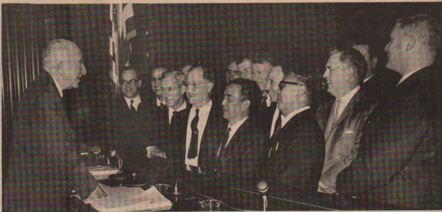
Senator Gruening meets with Alaska lumber officials who came to Washington protesting the export of unprocessed logs.