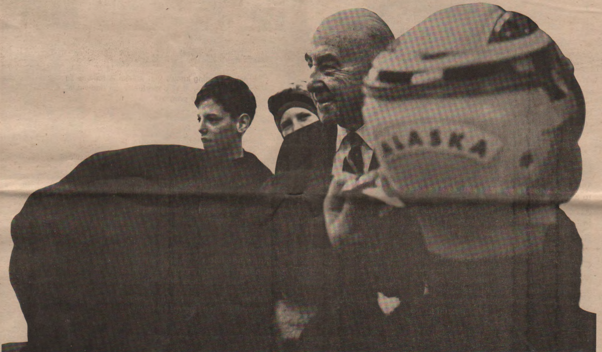
With visiting Anchorage hockey team in Washington.

A better future for Alaska's young people is the theme that runs through all Ernest Gruening's labors on behalf of the 49th State. Senator Gruening has often said that our young people are Alaska's greatest resource.