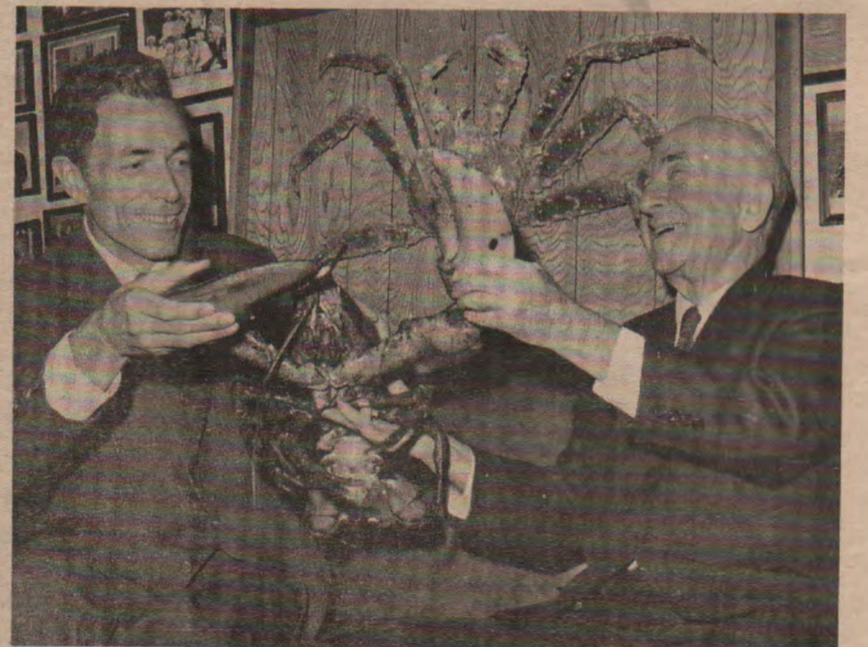
The lobster is large, but Senator Gruening tells colleague Claiborne Pell of Rhode Island that he prefers the Alaska king crab.