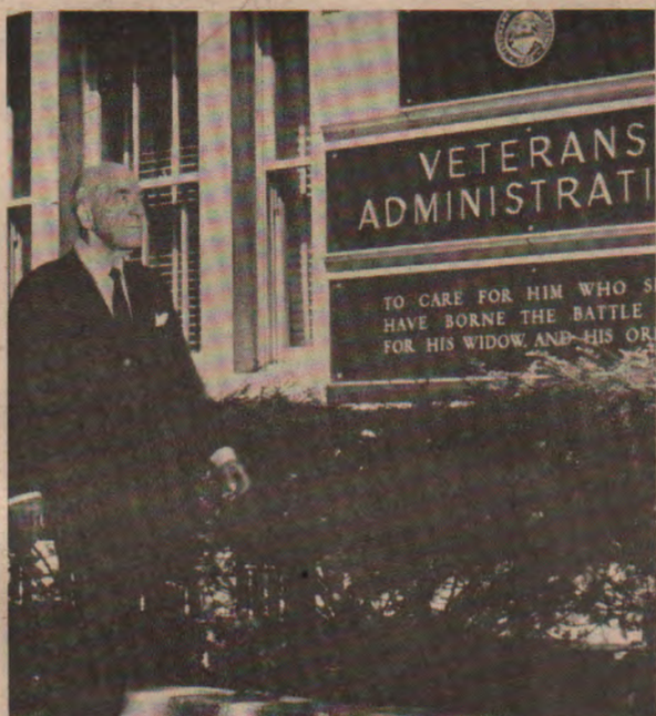
Senator Gruening keeps in close touch with Federal agencies that deal with Alaska problems. Gruening is known as a champion of Federal employees and veterans.