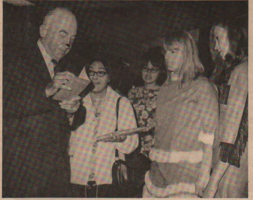
At young people's gathering in Anchorage.