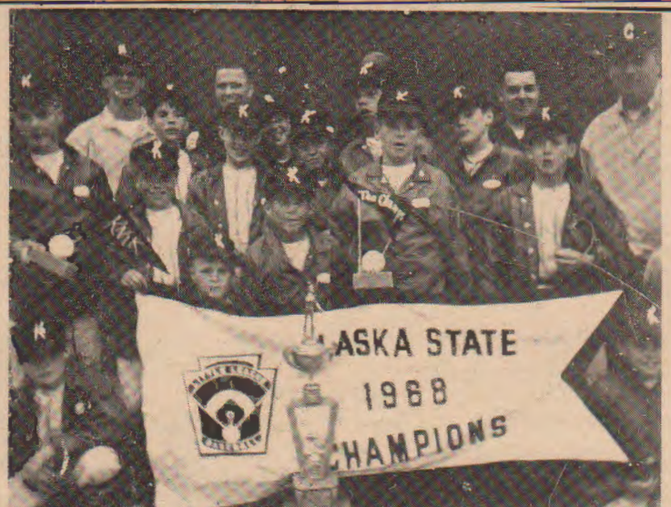
STATE CHAMPS! THE KNIK LITTLE LEAGUE ALL-STARS WITH LEAGUE FLAG AND TROPHY.