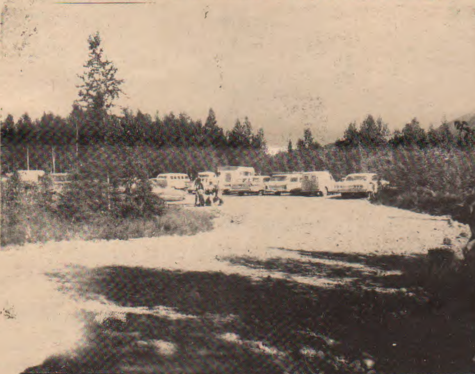
AMPLE PARKING SPACE HAS BEEN PROVIDED IN THIS WELL GRAVELED PARKING AREA.