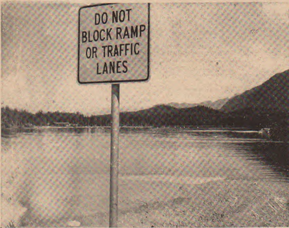
BOATS MAY NOW BE LAUNCHED QUICKLY AND EASILY ON THIS CONCRETE LAUNCHING RAMP.