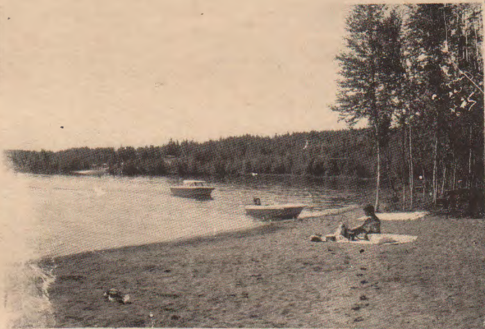
PICNICKERS AND BOATING ENTHUSIASTS HAVE BEEN WELL PROVIDED FOR AT MIRROR LAKE. NOTE BOAT LAUNCHING RAMP ACROSS COVE.