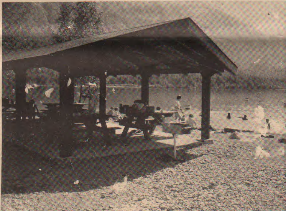
NO MORE RAINED OUT PICNICS HERE. THIS SHELTERED AREA AT MIRROR LAKE IS VERY HANDY FOR LARGE GROUPS.

launching ramp located across the cove from the swimming and picnic area. This has a fine gravel expanse with a concrete ramp extending out into the water. There is ample parking here also for cars and boat trailers and rest rooms are available too.