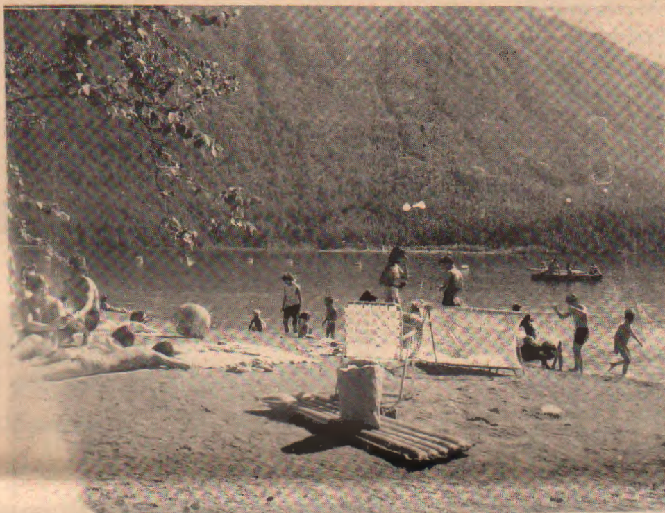
BEACH BUNNIES BASK ON THE SAND AT THE NEW MIRROR LAKE SWIMMING AREA, WHILE BOLDER ONES ENJOY DIVING OFF THE FLOAT.

CHUGIAK: The Chugliak and Eagle River Branches of the Anchorage Library will be merging into a single unit to be housed at one location, according to Polly Kallenberg, Chugliak Librarian.