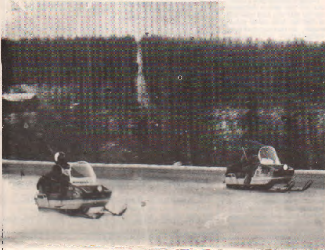
SNOW MACHINES SPEED BY MT. EKLUTNA DRIVE AND GLENN HIGHWAY IN THE EARLY HOURS OF THE OPENING DAY OF THE MIDNIGHT SUN 600.

EAGLE RIVER: A late Sunday afternoon fire caused an estimated $5,000 damage to an Eagle River home, according to Tom Take, Chief of the Eagle River Volunteer Fire Company.