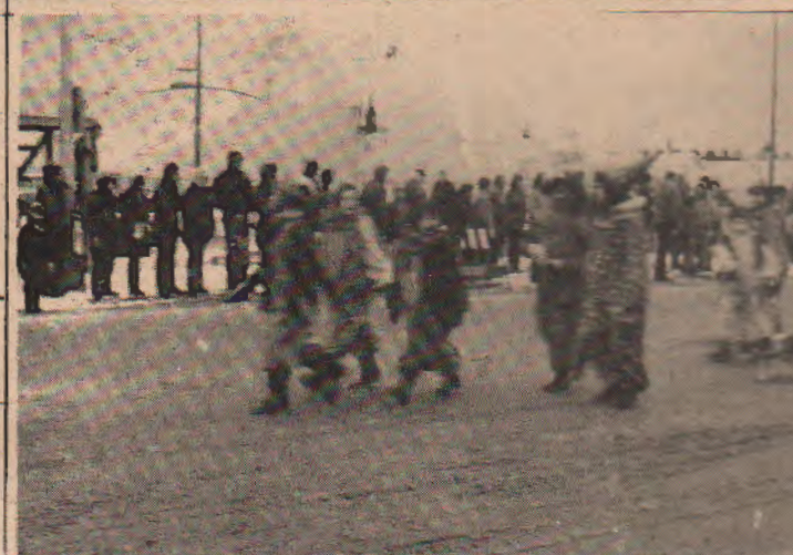
THE COLD DOESN'T APPEAR TO BOTHER THE CHUGIAK CLOWN CLUB, DOES IT?