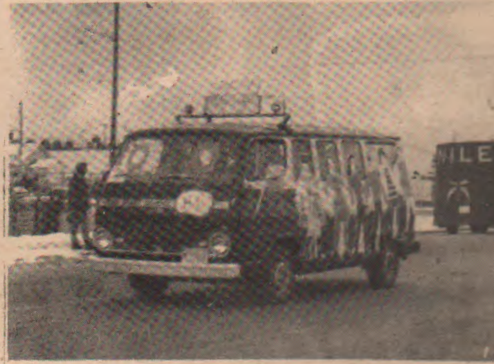
COLORFUL CARTOON CHILDREN DECORATE THE CHUGIAK HEAD START SCHOOL BUS.