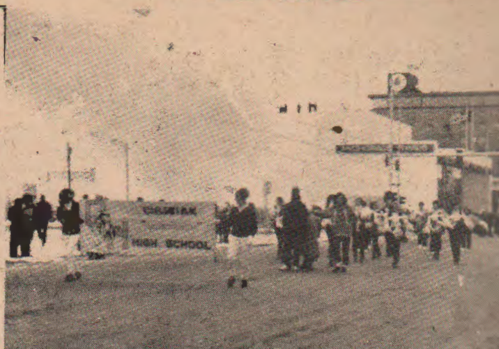
WE MISSED THE CHUGIAK HIGH BAND, BUT DON'T THOSE MUSTANG GALS LOOK GREAT?