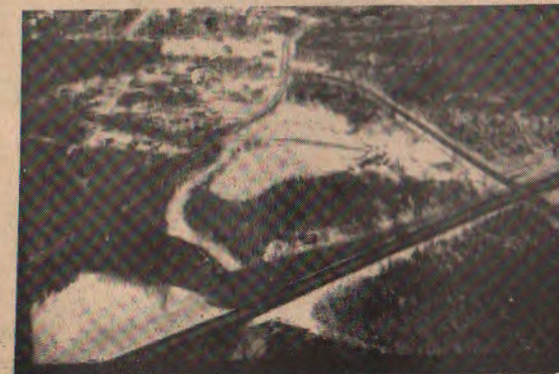
AERIAL PHOTOS SHOW PRESENT SITE OF CHUGIAK ELEMENTARY SCHOOL (left) AND PROPOSED SITE AT CHUGIAK CARNIVAL GROUNDS (right)