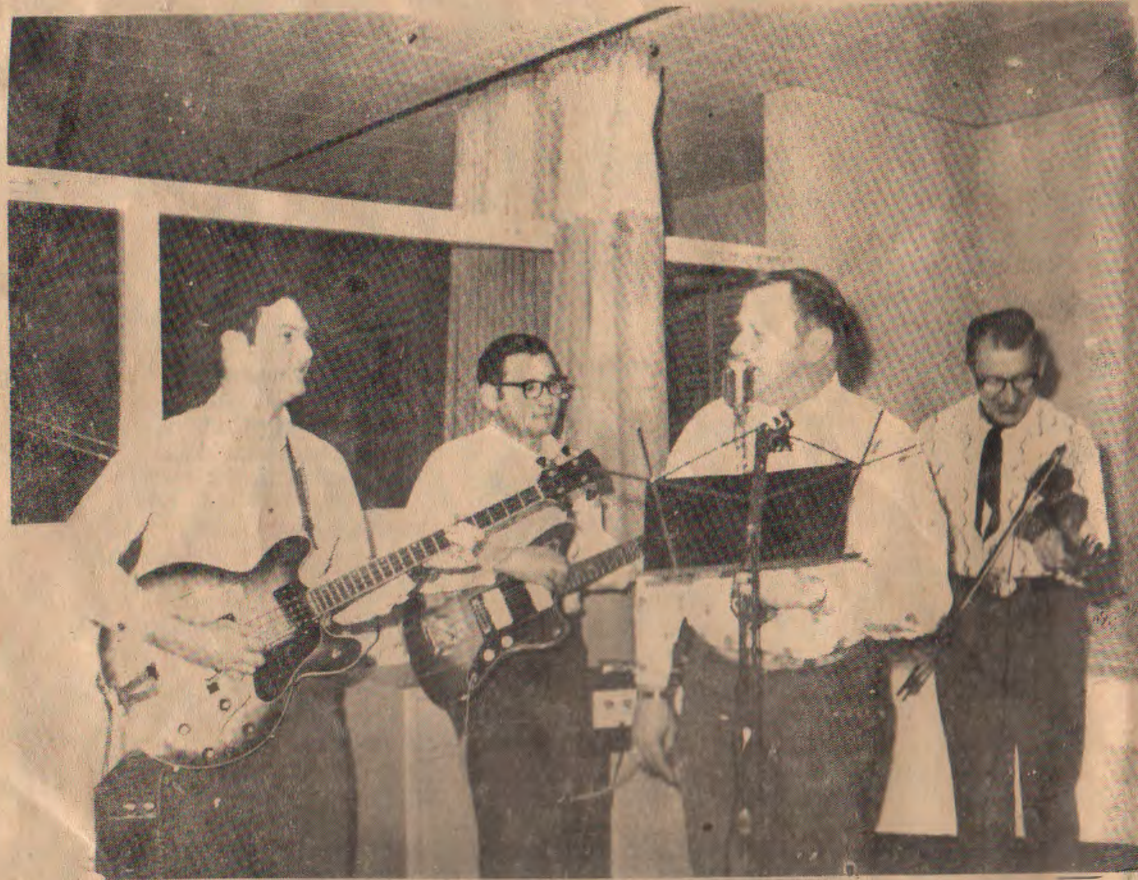
THE "WAGONMASTERS", VFW BAND, ENTERTAINS THE PATIENTS AT THE AIR FORCE HOSPITAL.