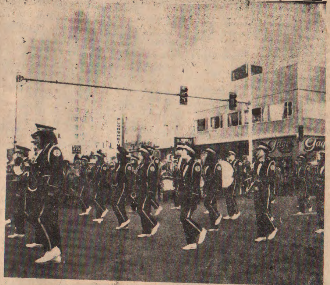
STEPPING SMARTLY, THE CHUGIAK HIGH SCHOOL BAND REPRESENTS THE COMMUNITY IN THE FUR RENDEZVOUS PARADE.