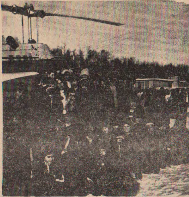
STUDENTS AT CHUGIAK GRADE SCHOOL CROWD AROUND TO GET THEIR PICTURE TAKEN WITH THE VISITING HELICOPTER.